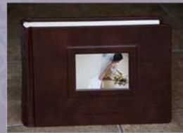
Fine Art Portrait (1 img per page)

All finished books ( proof books excluded ) provide minor retouching services, plus every image is individually color corrected & cropped to specification. Images are UV coated for protection from sunlight.